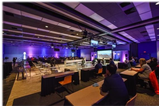
Example of a room. Photo non-contractual