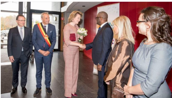
Queen Mathilde of Belgium, in the presence of Dr Denis Mukwege at the 1st congress in Liège.

The Montreal congress represents a unique opportunity for the world of research, feminist and community organizations and all those concerned by the key themes of the congress (gender equality, sexual and gender-based violence, women's and adolescent health and empowerment, sexual and reproductive health and rights, restorative and transitional justice, etc.) to exchange views on these issues, which are inseparable from the mission of Professor Mukwege, 2018 Nobel Peace Prize winner.