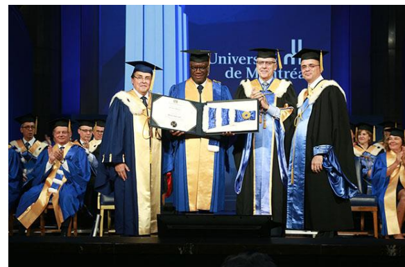
Awarding of an honorary doctorate to Dr Mukwege by the University of Montreal.